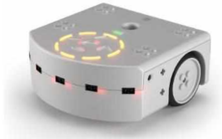
Figure 2. Thymio floor-robot

teach students how to identify and select a response. However, students often struggled with the Likert survey; and in this study, researchers determined that giving elementary student-participants the option, when possible, to answer yes or no, would produce a more accurate response. When developing any Likert survey, researchers “must adequately capture the specific domain of interest yet contain no extraneous content” (Hinkin, 1995, p. 969). Researchers wanted to capture the domain of interest, student-participants’ perceptions of floor-robots, in as accurate a fashion as possible. Multiple drafts of the survey were developed prior to finalizing the one used in this study to help ensure content validity. However, the survey was researcher-developed, and as such, reliability had not been established.