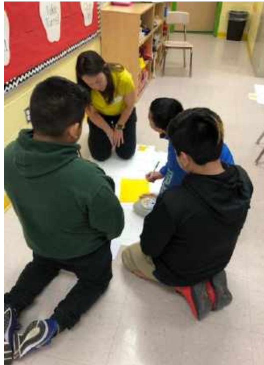
Figure 5. Assisting students