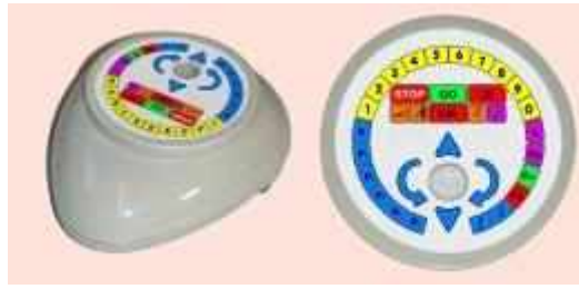
Figure 1. Roamer Floor-robot