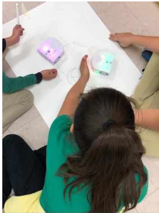
Figure 8. Working with multiple Thymio floor-robots

During this concluding lesson with floor-robots, there were four adults assisting students, including the cooperating teacher. The addition of three certified teachers and one graduate assistant limited any difficulty in managing behaviors; but, students remained engaged in groups. There was little to no off-task behavior observed by researchers. However, the researchers cannot determine if a single classroom teacher could effectively assist groups with a similar station lesson. Out of the seven stations, there were four adults readily available to assist. If this were a single classroom teacher, managing behavior and/or addressing students' questions may be more difficult.