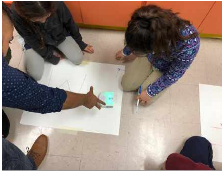
Figure 9. Assisting students