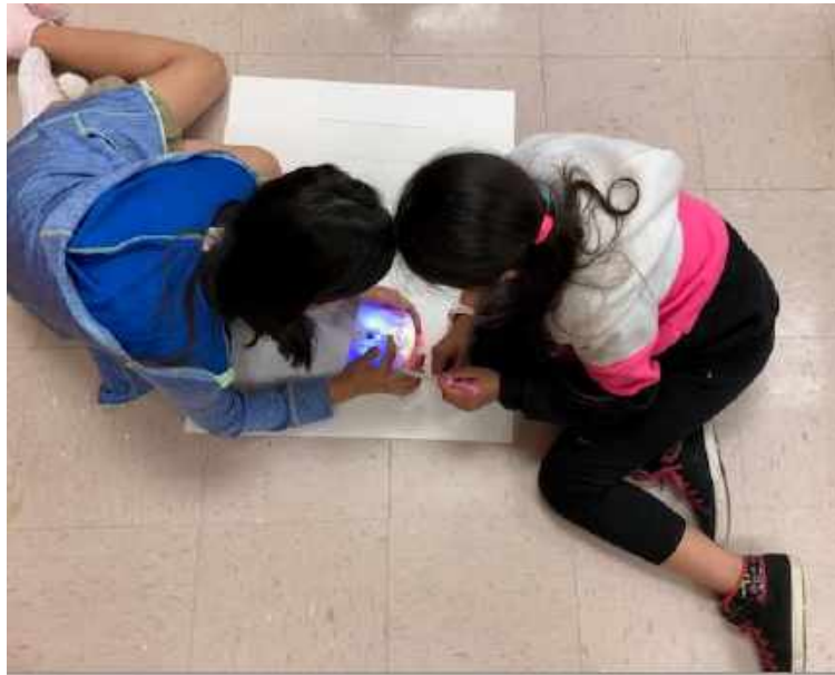
Figure 7. Programming Thymio to travel in circles