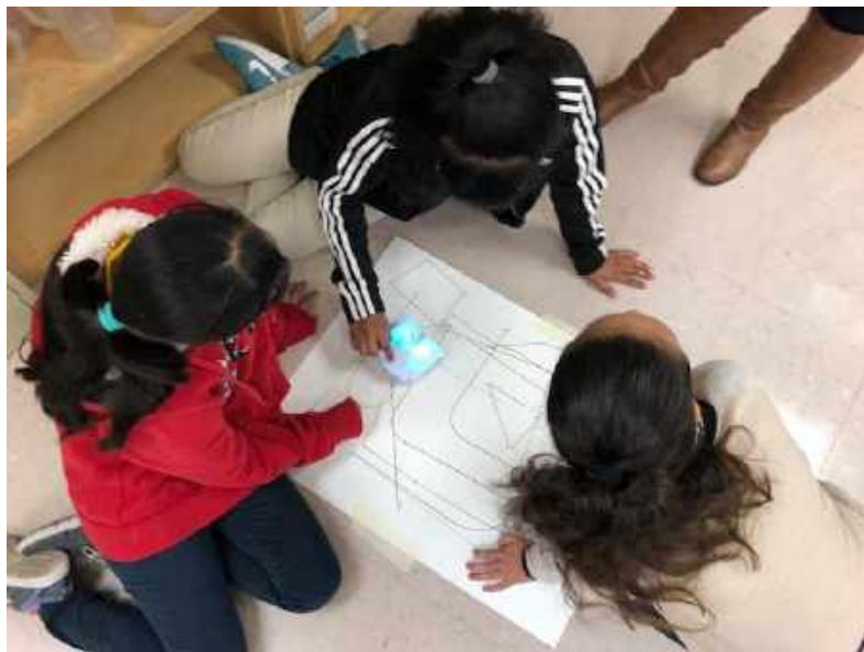
Figure 6. Working with Thymio

Students selected which exit they would program the floor-robot to travel toward; and students worked as a group, writing down code and analyzing the sequence of steps to ensure success.