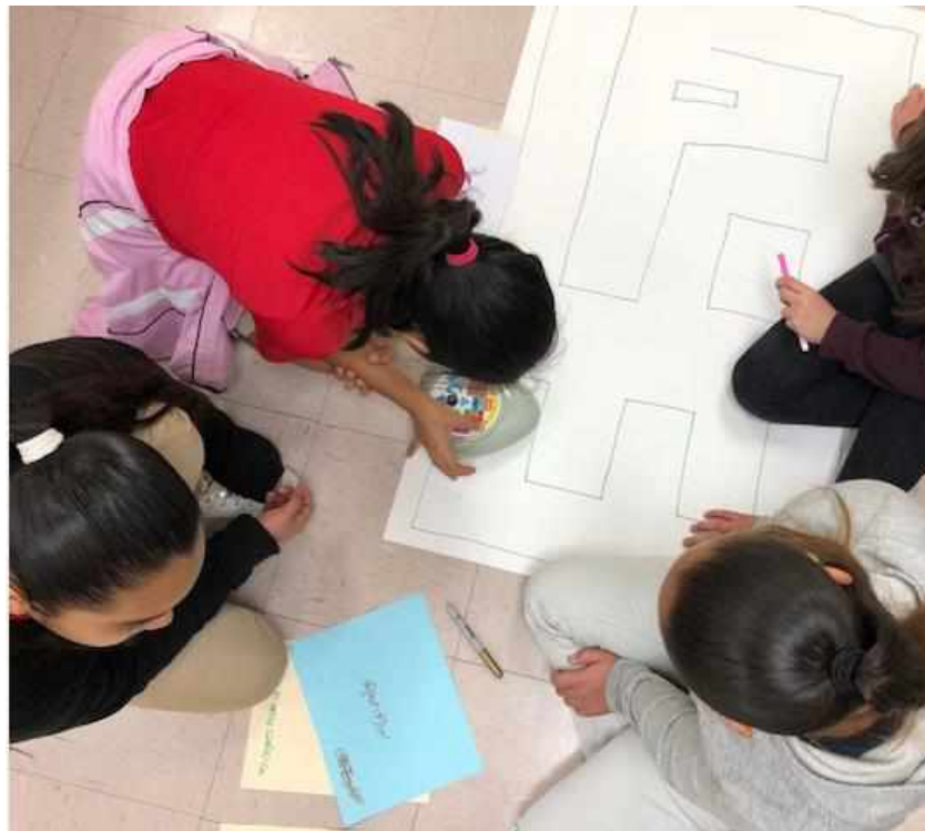
Figure 3. Working with Roamer at the Maze