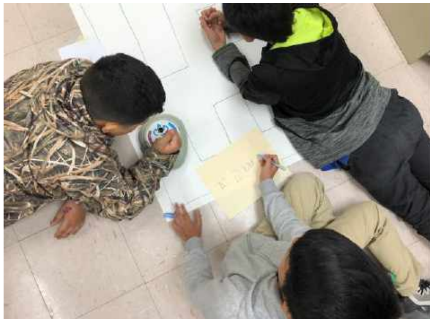
Figure 4. Writing code for Roamer

in groups of three to four, students were engaged with the floor-robots at different stations, moving between stations after twenty minutes. Data on this final engagement with floor-robots was gathered by researchers.