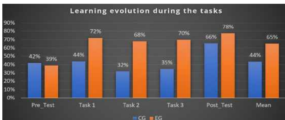
Figure 1. Evolution of learning during the performance of tasks/tests by group

Using the averages of the results obtained in the tests and in the three tasks, it was possible to obtain Figure 1 and Figure 2, where there is an evolution in learning both in CG and EG.