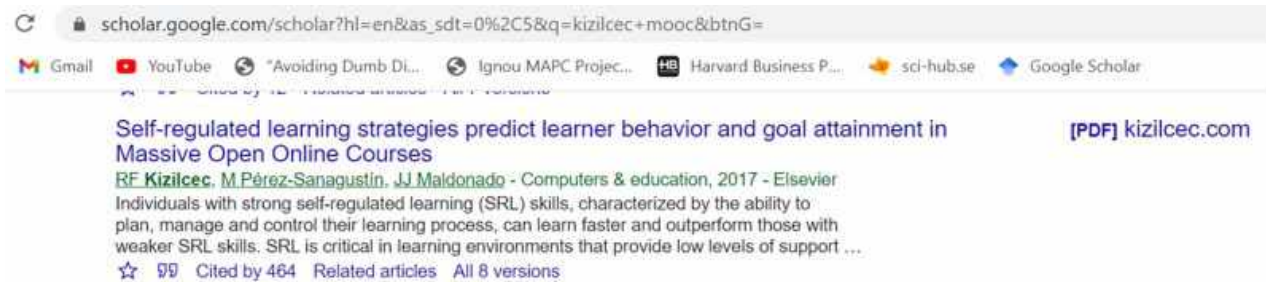
Figure 2. Google citation count

To ensure the trustworthiness and validity of the research, we did the article selection independent of each other and later, cross-checked the data, to chaff out discrepancies so as to reach consensus on analyses. Finally, the identified articles from 2013 to 2020 was 102. The inter-rater agreement to check the reliability of search was calculated dividing total number of codes with agreement by the total number of codes. The inter-rater agreement across all items came at 84.95%. To reconcile the differences, we discussed and resolved the differences to have uniform code assignment across all the items. The data collected carried various subject of study such as the journal name, publisher, database, citation trend, year of publication, research methodology, theme and context of study, and theoretical framework used in the study. Other relevant and important data collected included author name and institutional affiliation, institution geographical location, and the year of study.